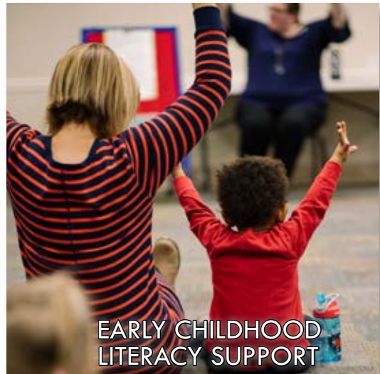
EARLY CHILDHOOD LITERACY SUPPORT