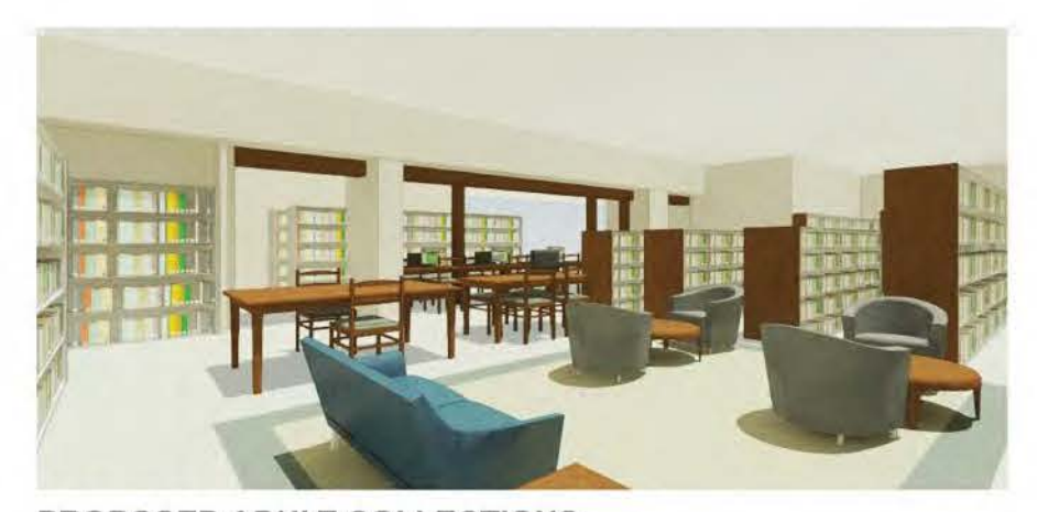
PROPOSED ADULT COLLECTIONS