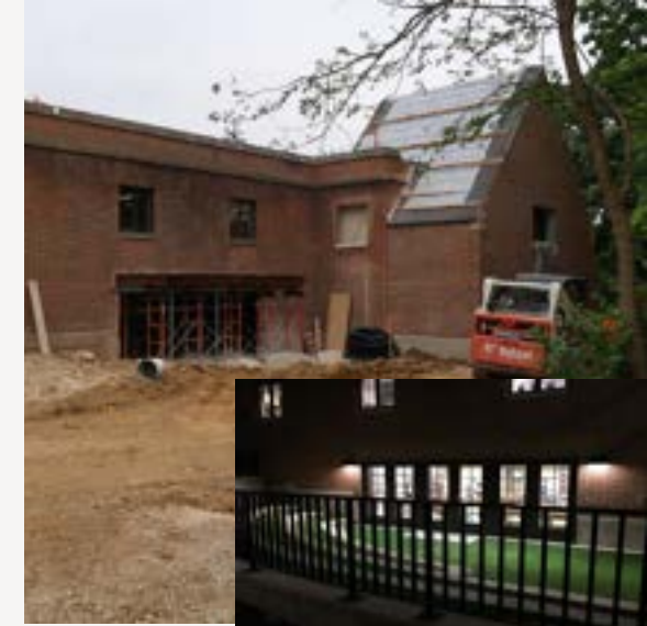
The Children's Terrace highlights the library's connection to neighboring Katharine Wright Park, bringing views of the park inside the library and creating a new library space for outdoor play and programs.