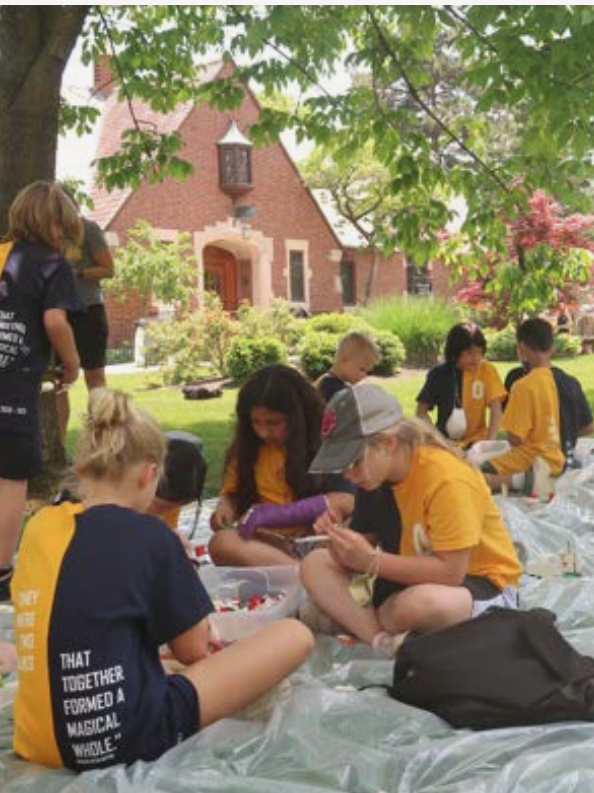
Staying safe and connected: students from Oakwood City Schools visited the library lawn for a field trip, carrying on a long tradition of partnership in education between the library and the school district.