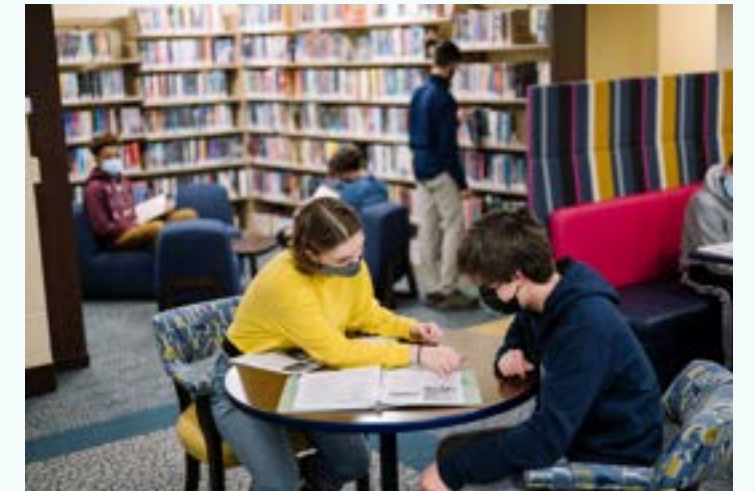
The Learning Commons also features a larger space for teens to hang out, read, work, and socialize. Through a mix of booths, tables, and comfortable seating, the new teen area creates opportunities for high schoolers to hang out or work, on their own or in groups. The area also includes teen computers, young adult books and magazines, and the game collection.