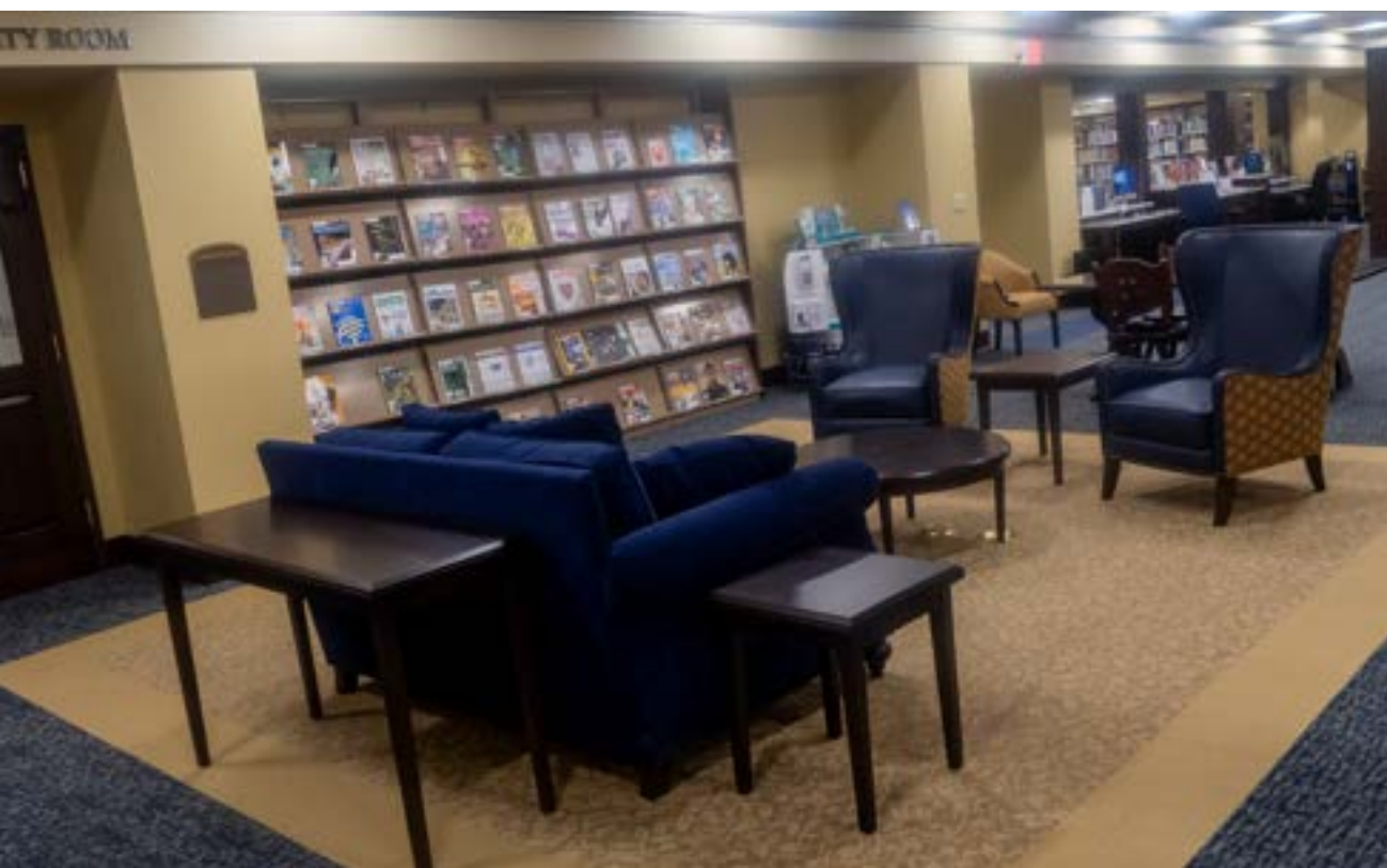
Left: A living room style sitting area is furnished with historically-sensitive chairs and tables.

With project partners from DANIS Construction and LWC Inc. architects, the library was able to complete the work on time and under budget.