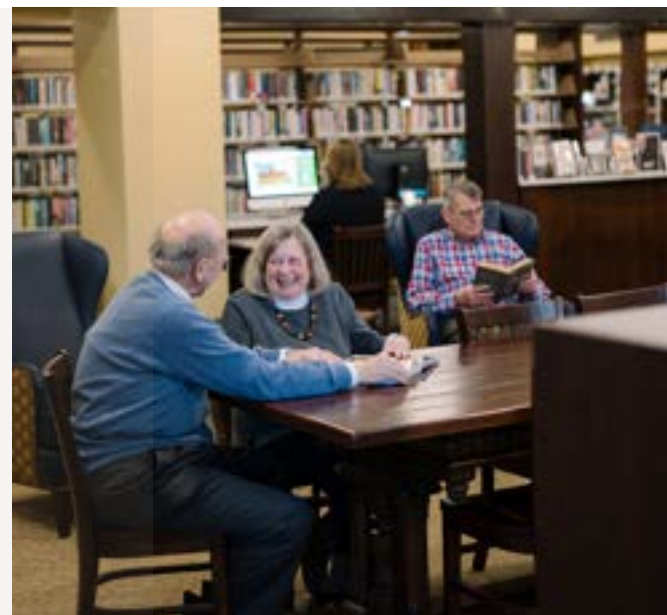
Above left: Teens connect at the new computer area built with them in mind. Above right: The nonfiction living room on the Main Level creates more room for reading and working. The large wooden table was donated to the library and helps extend the historic 1939 feel throughout the newly renovated space.