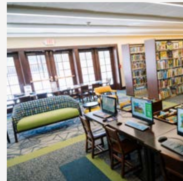
The library's lower level has been transformed from a windowless basement to a vibrant children's area with fun and durable seating, a computer area, book stacks, kid-friendly storytime corner, and more.