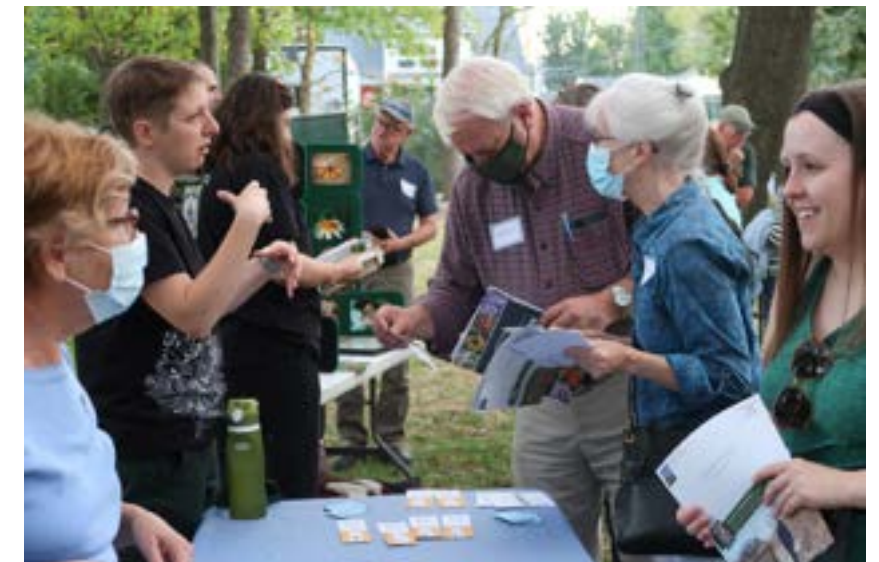
The "Nature's Best Hope" Community Read ignited community interest in native plants. During the summer, the library offered follow up events, including a native plant tour and plant social where local residents shared information and connected with local experts.