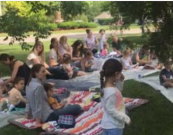
During warm weather, families met on the library lawn for storytime, complete with songs, stories, and play led by librarians. After being virtual for many months, returning for in-person, outdoor storytime was a joyful experience for kids, caregivers, and Wright Library staff.

"I helped a patron make a COVID vaccine appointment. This gentleman was very unsure about using a computer at all, let alone navigating the state's Get The Shot website. I walked him through the process, from signing in to the computer to accessing the website, to choosing a location. When we filled out the interactive form to book the appointment, it required an email address, which the patron did not have. I put in a made-up email address, and the form accepted it (otherwise he would have been unable to book the appointment). The confirmation code was sent to his cell phone as a text message, which I then entered for him. (He did not know how to retrieve the text message on his phone, so I did this for him.) He is now scheduled for tomorrow afternoon! I printed the confirmation page for him, and he was very grateful for the help."