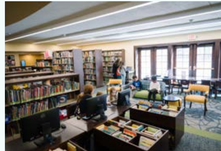
The David and Juliet Flory Learning Commons in the newly renovated Park Level includes a large, sunny children's area with stacks of books; comfortable seating options; toys, puzzles, and puppets for active play; a Storytime Corner; and a Children's Terrace perfect for outdoor exploration and learning. French doors to the Terrace as well as three backlit stained glass windows flood the space with light.