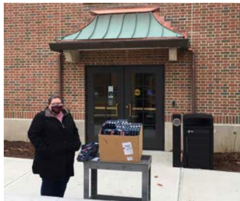
Above left: Community members gathered for a garden tour to learn about native plants and connect with other nature lovers at this program inspired by Wright Library's community read of the book "Nature's Best Hope." Above right: In December, staff distributed 1,728 COVID home test kits in just four hours.