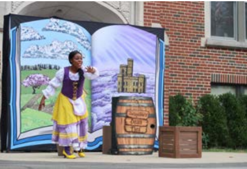
This one-woman performance of Jacqueline and the Bean Stalk dazzled audiences outside Wright Library, creating a COVID-safe live theater experience for families.

Thanks to the support of generous donors, the Wright Memorial Public Library Foundation supported several library initiatives in 2021, including the Holds Pickup Locker, live falconry demonstration, and theater performances by The Children's Theatre of Cincinnati.